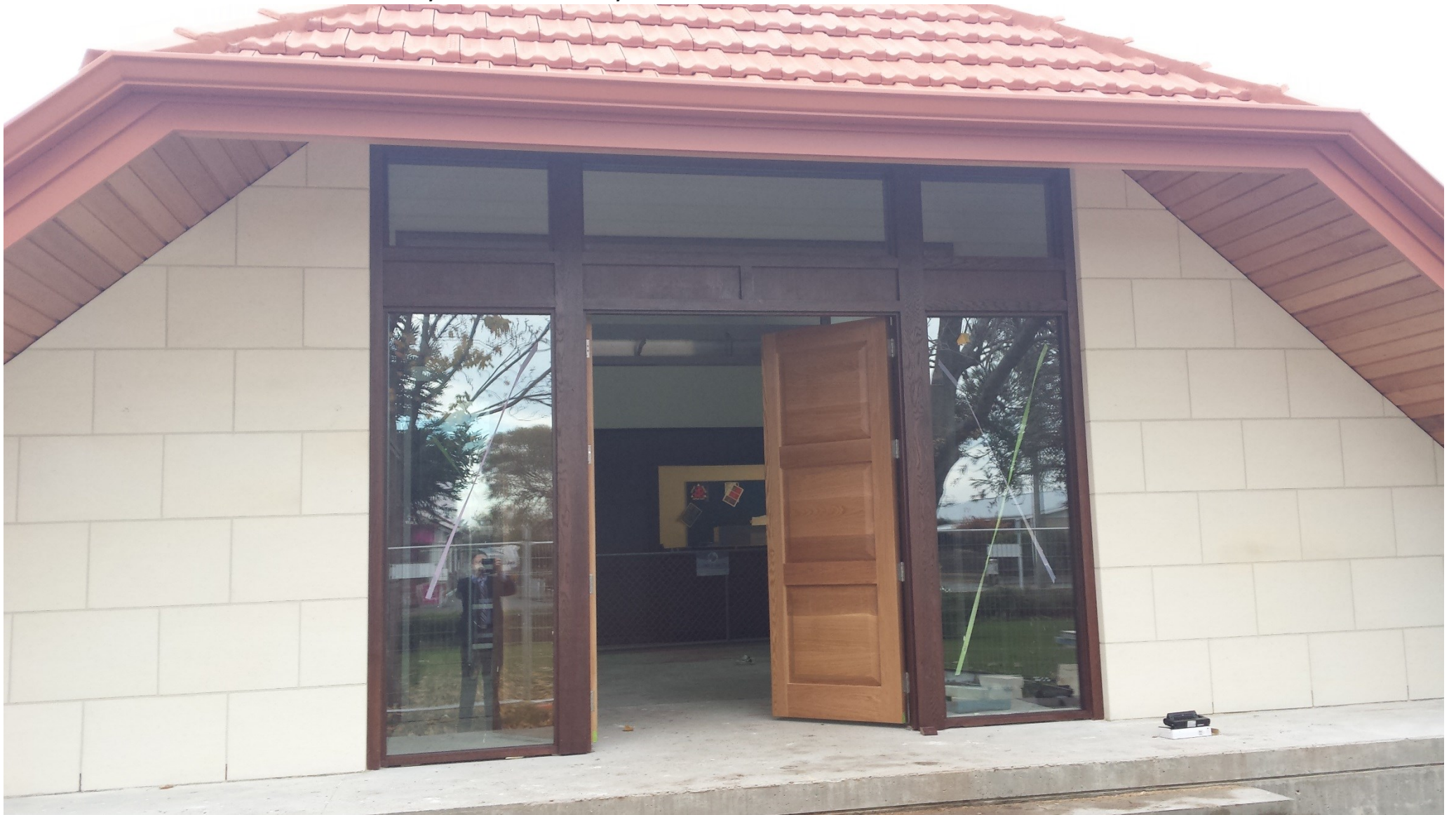
Photos of the new entrance and foyer as of 17 May.